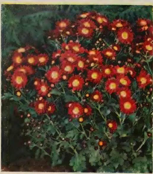
MISCHIEF. 75c each; 3 for $2.00